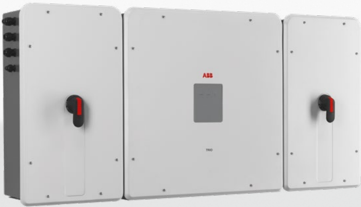
— TRIO-TM-50.0/60.0 outdoor string inverter

This new addition to the TRIO family, with 3 independent MPPT and power ratings of up to 60 kW (480 V version), has been designed with the objective to maximize the ROI in large systems with all the advantages of a decentralized configuration for both rooftop and ground-mounted installations.